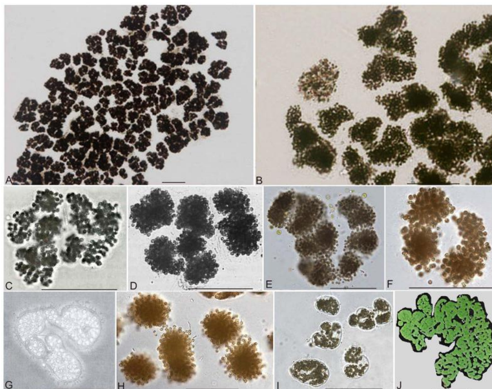
Figure 3 | Shapes and sizes of colonies of present-day Microcystis . (A, B): large tree-like; (C, D): medium irregular; (E): medium treelike; (F): medium circular; (G), medium embryo-like; (H): small subspherical, medium 8-shaped; (I): medium trilobate, embryo-like; (J): large irregular. Bars 0.1 mm in (A–I), and 1 mm in (J). (A) and (B) are cited from Fig. 7.2 of reference 29 ; (C, D, E, F, H) cited from reference 26 ; (I) cited from reference 27 ; (G) from reference 25 ; (J): taken in this study.

organisms associated with the microbialites. Our study shows 417 species of marine invertebrates in the crinoid limestone underlying the microbialites compared with 25 species in the microbialites, including ostracods, small gastropods, small worms, and tiny foraminifers.